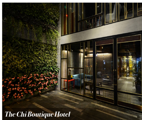
The Chi Boutique Hotel