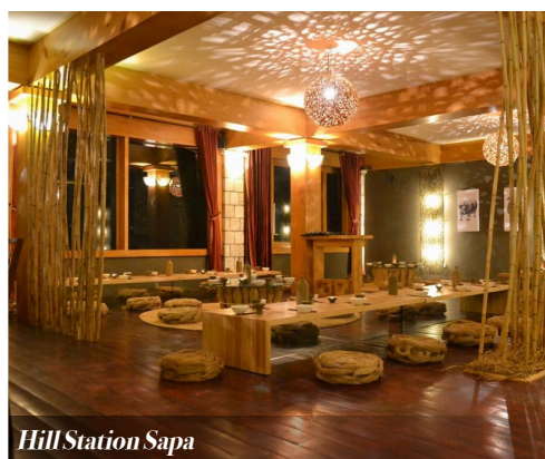
Hill Station Sapa