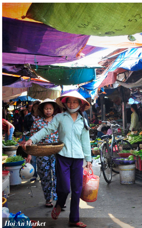
Hoi An Market