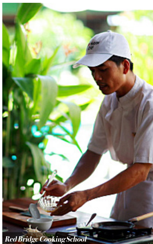
Red Bridge Cooking School