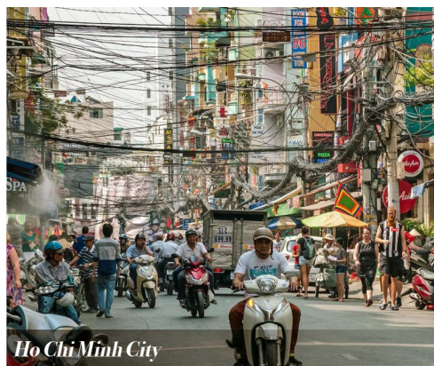
Ho Chi Minh City