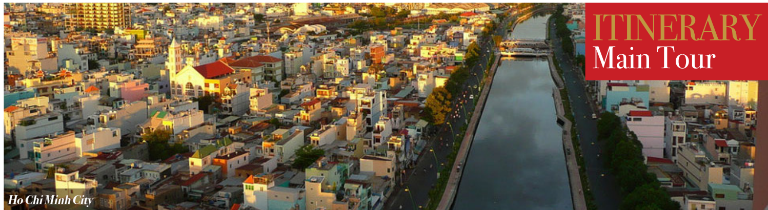
Ho Chi Minh City